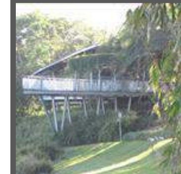
Mackay Regional Botanic Gardens