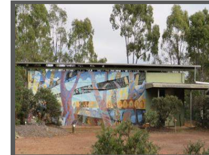
Myall Park Botanic Gardens Glenmorgan

The Friends currently activate • Visitor & Guide services • children's & adult education • displays • horticultural library • science & research projects • art plant botanic craft displays & sales • Herbarium • events & presentations. All in a small temporary structure.