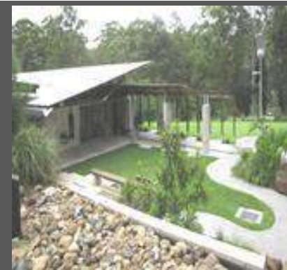
Maroochy Regional Botanic Gardens