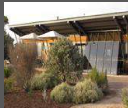
Aridland Botanic Gardens Port Augusta